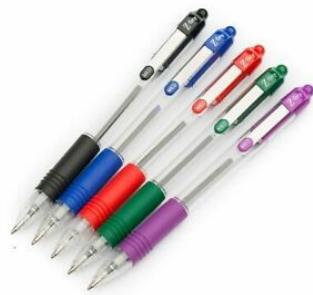
Alternative colour pens such as green and purple

It is always advisable though to be as well prepared as possible, so you may find having the following items useful: