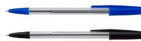
Black or blue pen for writing