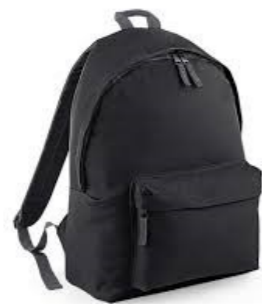
Strong school bag

You are expected to bring in the basic equipment everyday which includes a school bag, pen, pencil and ruler.