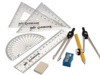
OR a Maths set