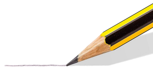
A HB or 2B pencil for general use.