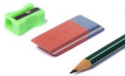
Sharpener and rubber